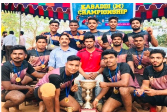
College Kabaddi Team