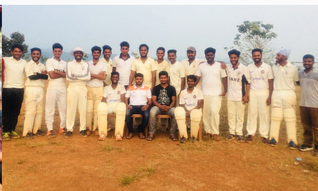
College Cricket Team